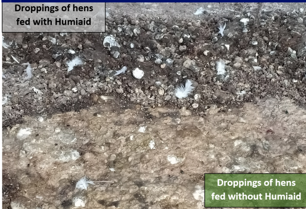
Droppings of hens fed without Humiaid